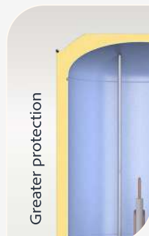
Foam thickness 25 mm

Standard Plus series water heaters are equipped with an external temperature controller located on the bottom cover of the unit, allowing easy setting of the desired water heating temperature. These units feature a 2 kW heating element and improved thermal insulation, ensuring high efficiency and comfort of use.