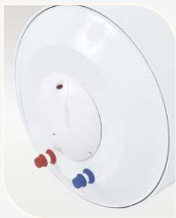
Hidden temperature controller