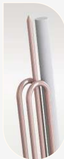
Grzałka 2 kW