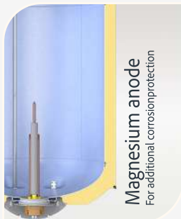
Magnesium anode For additional corrosion protection

Classic, vertical water heaters with a heating element, a dial thermometer, and a light indicator. The water heaters are protected against overheating and dry heating.