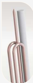
Heater 2 kW