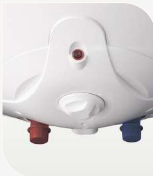
External temperature controller