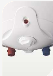
External temperature controller

Versatile, convenient to use, and highly efficient. Be as independent and autonomous as possible with NOVAtec. Water heaters can heat water using either an electric heating element or a heat exchanger.